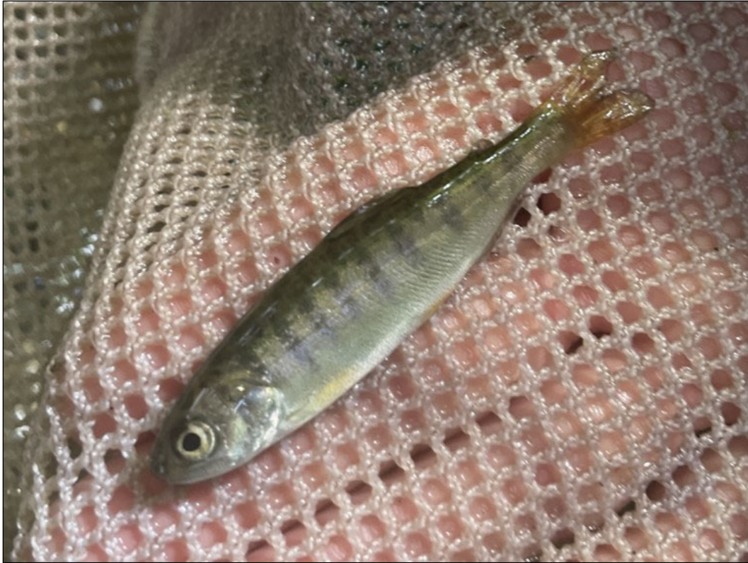
Figure 1.—Juvenile coho salmon captured at waypoint 1464.