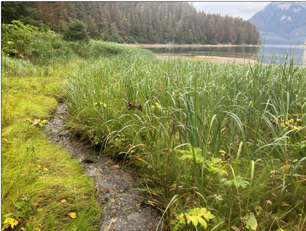
Figure 2.—Downstream view of channel near intertidal at waypoint 1464.